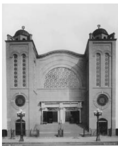
Beth Hamedresh Hagodel

Jewish immigrants settled in Rochester beginning around 1880. There were dozens of synagogues in the area roughly bounded by Central Ave, St. Paul St.,